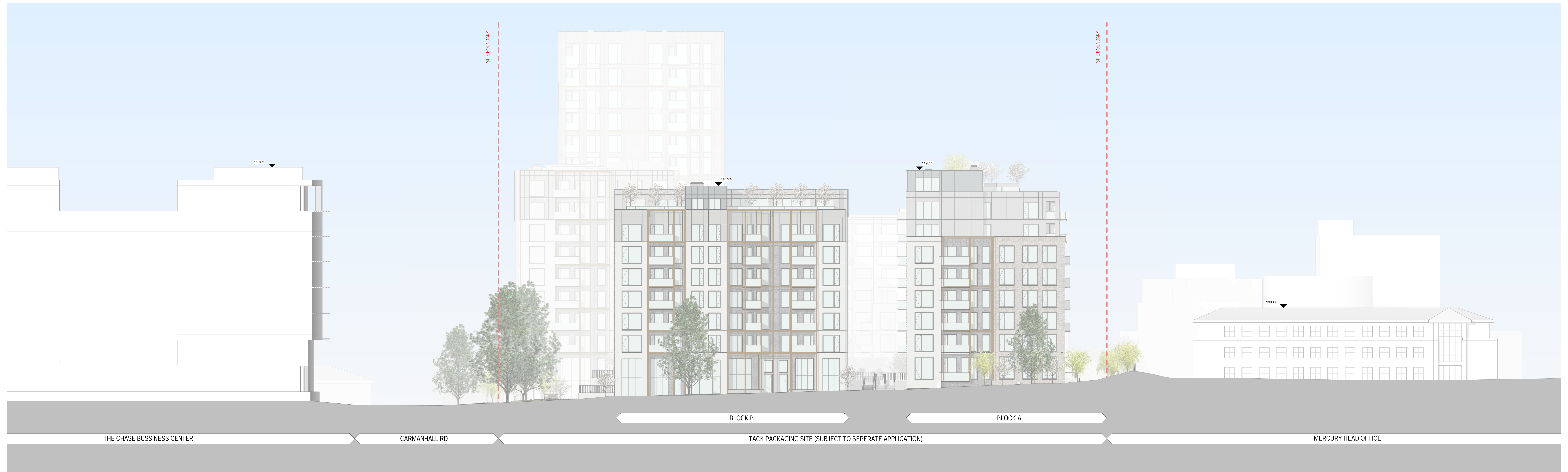
1 PROPOSED NORTH WEST CONTEXTUAL ELEVATION Scale: 1:200